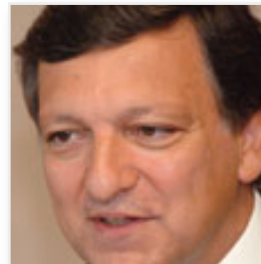
José Manuel Barroso President of the European Commission

" T he central theme of the Summit will be cohesion policy in Europe today and, above all, the future of the European Union. At this summit, we shall try to identify together the direction in which we want to move forward with this common European policy, whose primary aim is to bolster the least developed areas of Europe. The purpose of the summit is to provide a forum for all those of you who want and have something to say about the cohesion policy of the future, and I am greatly looking forward to the findings and initiatives that will come out of this meeting."