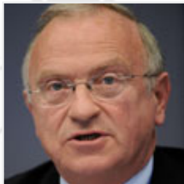
Luc Van den Brande, President of the Committee of the Regions

" C ities and regions are the first to be able to boost the economy and businesses, and are best placed to guarantee social cohesion and bring citizens on board the European political project. This means that Europe cannot impose itself on its citizens but should build itself through them and in the areas where they live and work."